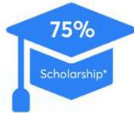
Rank 11 - 100