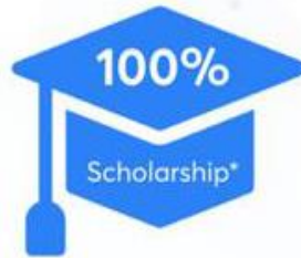
Rank 1 - 10

Live test, available in both English and Hindi