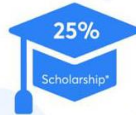
Rank 501 - 1000